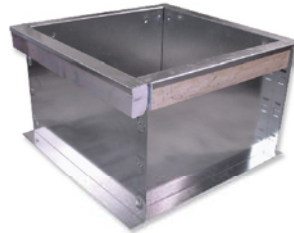
Cliplock 1000 Knockdown Curb